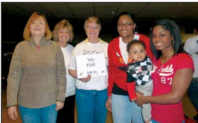
Gold Sponsor for 2011, Teacher’s Credit Union, put the FUN in fund raising and came out to support the day with several teams. Pictured here, Team TCU Five.